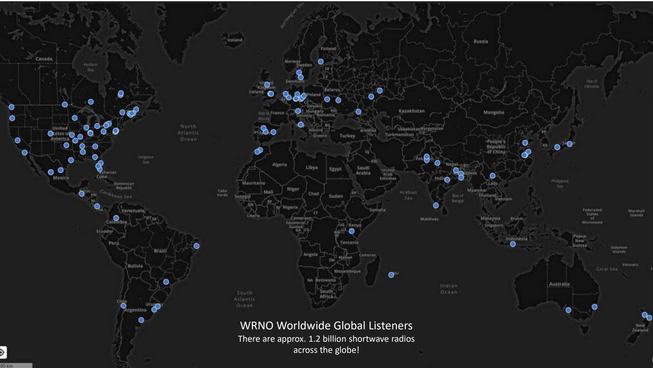
WRNO Worldwide Global Listeners There are approx. 1.2 billion shortwave radios across the globe!